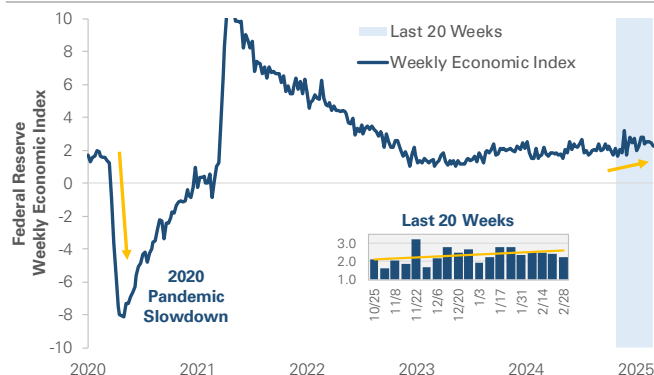
FIGURE 3 – Weekly Economic Index (Last 5 Years)

Source: Federal Reserve. The Weekly Economic Index (WEI) is composed of ten high-frequency indicators, including unemployment insurance claims, fuel sales, electricity output, retail sales, rail traffic, tax withholding, steel production, consumer sentiment, and two weekly economic surveys. Time Period: January 3, 2020 to February 28, 2025 (latest available data as of March 11, 2025).